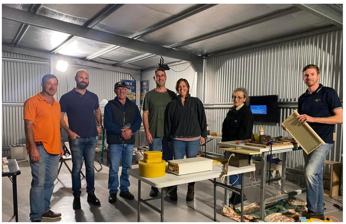
In the Honey Shed. (6/03/22)