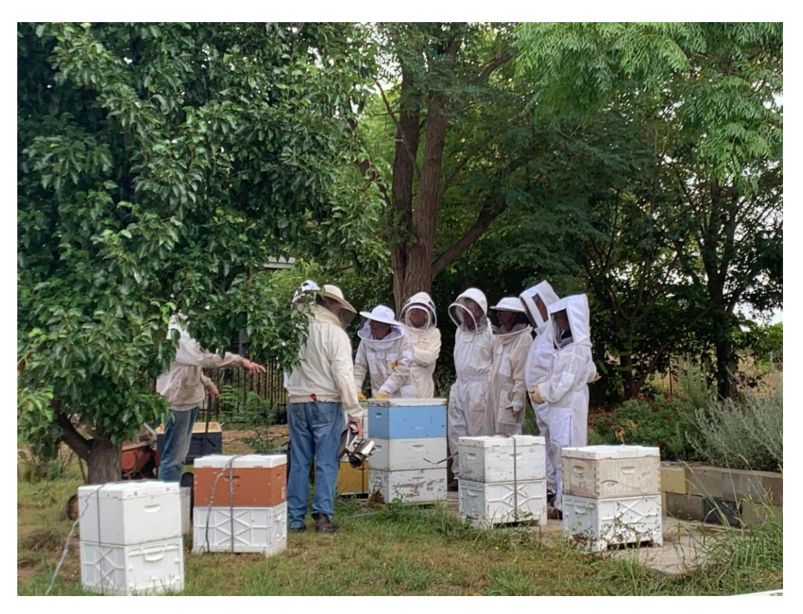
In the Bee Garden. (26/02/22)