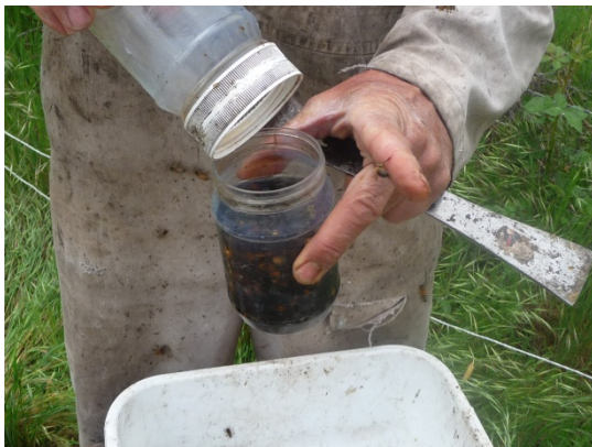
Screw the two mite shakers together firmly.