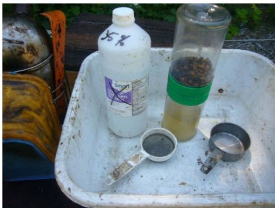
A functional mite washing kit, including a white bucket, mite shaker, bottle of 25% alcohol, a measuring cup and a sieve.