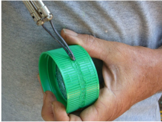
A soldering gun joining the two plastic lids together, with both inner lids removed and the 1/8" wire mesh sandwiched between the lids.