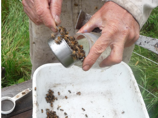
Pouring bees into the mite shaker.