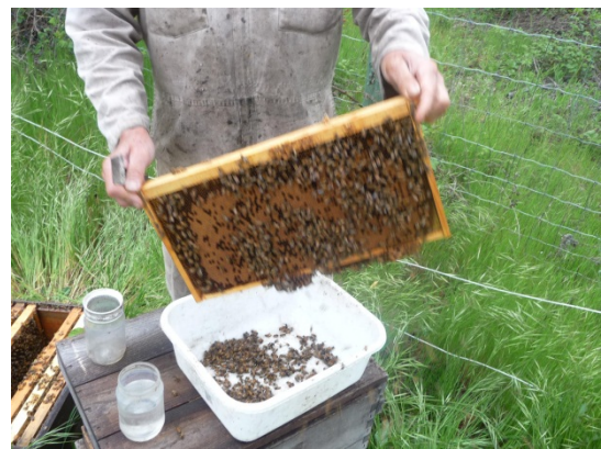
Shake a brood comb into a container.