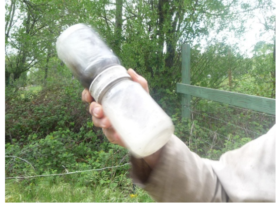
Shake the mite shaker jars vigorously for around 20 seconds.