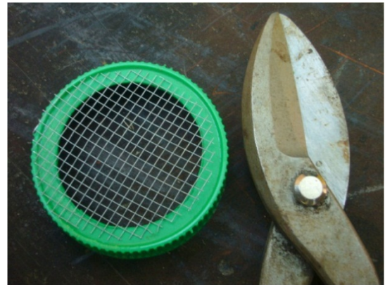
A plastic lid with the inner removed and covered with a section of 1/8" wire mesh.