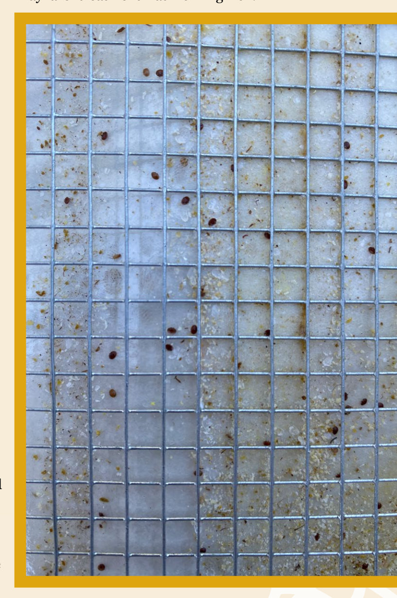
Figure 1. Sticky mat section and metal mesh. Varroa mites are the dark oval dots. 2 weeks into Bayvarol treatment, this mat had 505 dead mites on it.

I treated on 8 October 2023 with the synthetic miticide Bayvarol for 6.5 weeks. The treatment period is 6-8 weeks for this product. I removed the Bayvarol strips at 6.5 weeks, because a major nectar flow had started and Bayvarol cannot be used during a peak nectar flow. During the first two weeks of Bayvarol treatment I also had a sticky mat protected by a metal wire mesh ( Fig. 1 ) in the hive, to see how many mites were killed by the treatment. The mat was a bit weather-damaged by 2 weeks in, so I removed it and counted my mite drop. 505 mites in total! The Bayvarol treatment was working well.