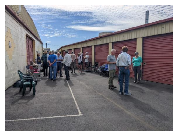
Members at the April club day

We will be practising lighting a smoker and keeping it going. See how to open a hive and arrange the brood frames for wintering your bees and practise the sugar shake.