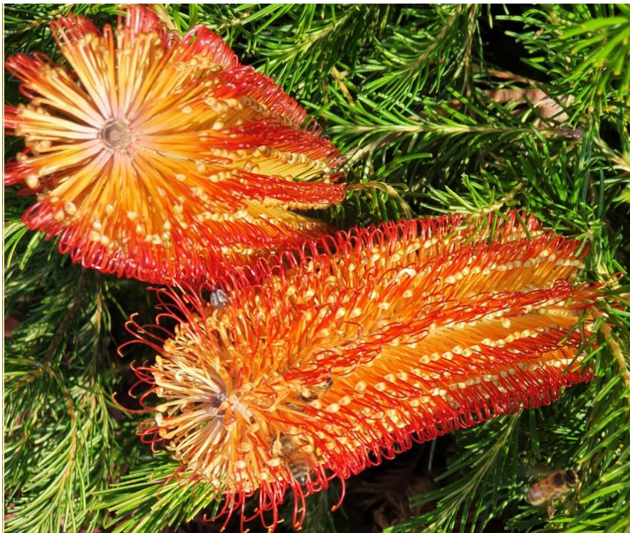
Bees enjoying the banksia.

11th - Field Day 12th - Close for Newsletter 15th - Meeting 7:30pm 19th - Newsletter out